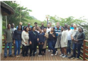
Course attendees at Silaka Nature Reserve Eastern Cape

In August 2016 WWF in partnership with DEA O&C presented the WWF developed MPA Managers Introductory 5 day Short course at the ECPTA managed Silaka Nature Reserve. This year's course in August was a special one as an agreement was now in place with NMMU who have registered this course as a short learning